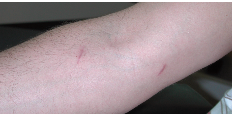
Figure 3: Dual oblique incisions at 2 months following surgery for PMNE.

The interval between the flexors and extensors is identified by palpation. The distal incision is 2.5cm long, oblique, centered over the median nerve, starting 3cm distal to the flexion crease of the elbow. The medial epicondyle is identified by palpation. The proximal incision is 2cm long, oblique, centered over the median nerve, ending ~3cm proximal to the medial humeral epicondyle. Under general anesthesia, the arm is exanguinated by gravity and a touriquet inflated. Skin incisions are completed and injected with 0.25% bupivacaine. Thin, narrow retractors are used for exposure. A loupes-mounted headlight (Zeiss) is used for illumination of the surgical field. An assistant with strong arms, excellent stamina, and the ability to hold quite still is particularly helpful. The median nerve is identified proximally and followed distally, with release of any fascia in contact with the nerve. The incisions are closed with absorbable monofilament sutures and steristrips placed. Tourniquet time is approximately 20 minutes in the average size arm with no unusual anatomic variations.