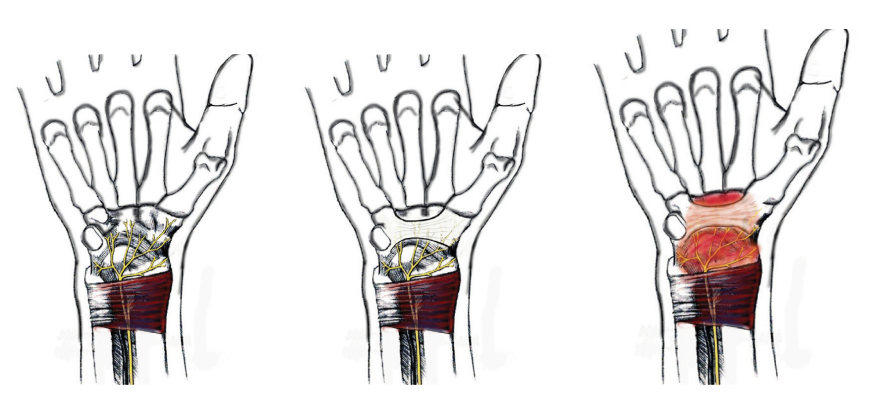
Figure 2: Why PMNE hurts in the wrist: 1) The terminal branch of the AIN is a sensory nerve that innervates the carpus, 2) which is deep to the carpal tunnel, and 3) compression of the AIN proximally causes referred pain in the wrist/carpal tunnel.

Figure 1: There are multiple sites where the proximal median nerve can be compressed. Mild compression of the proximal median nerve causes pain in the distribution of the median nerve, ie, hand/wrist.